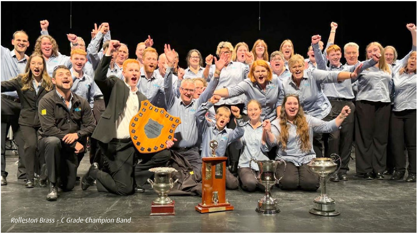
Rolleston Brass - C Grade Champion Band