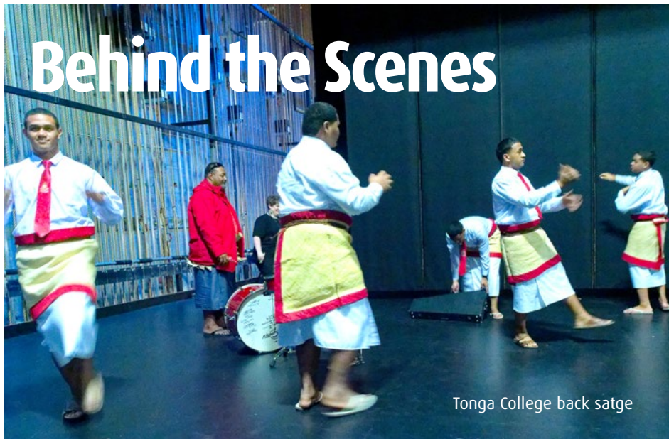
Tonga College back satge

I was a volunteer helper at the recent National Championships in Wellington, mostly working backstage at the Opera House, assisting the C and D/Youth Grades.