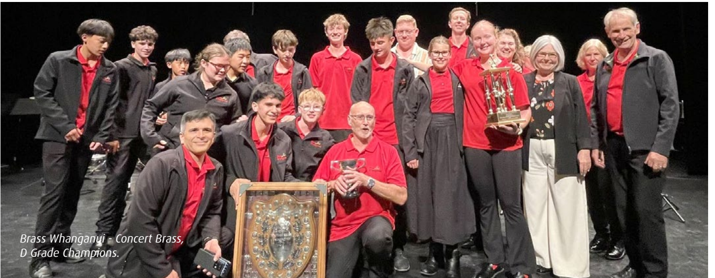
Brass Whangānui - Concert Brass, D Grade Champions.