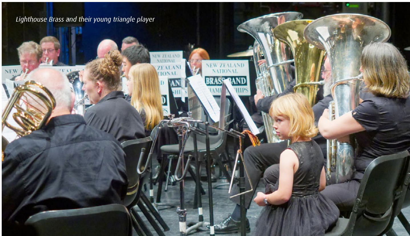
Lighthouse Brass and their young triangle player